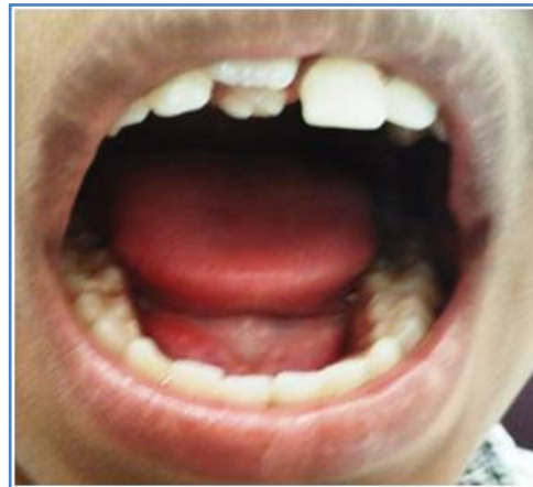
Fig. 2:A talon cusp on right maxillary supernumerary tooth and presence of one extra lateral incisor on the same side.