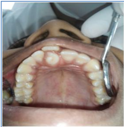
Fig. 1:A talon cusp on a right maxillary supernumerary tooth resulting in slight labial position of the right central incisor and midline diastema.