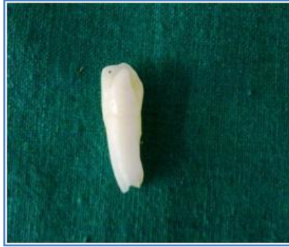
Fig. 4: Extracted supernumerary tooth. Talon cusp on the palatal surface of the supernumerary tooth, extending from the cemento-enamel junction to the incisal edge.